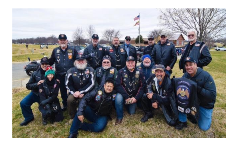
Riders participate at Wreaths Across America at Cheltenham Veterans Cemetery.