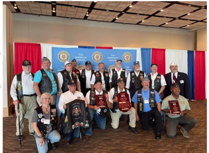
103 rd MD State American Legion Convention in Ocean City MD