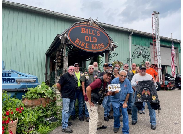
Riders in Bloomsburg, PA