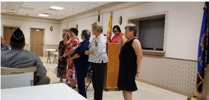
Unit 82 Auxiliary Officers for the year 2021-2022

The baby back rib dinner on July 16 was our first attempt at a dinner coming out of the pandemic. We were not sure what kind of turn out to expect. It turns out people were ready to get out and enjoy the good food at the Post. We were planning on preparing 120 dinners but because of a mix up with the rib order we only had 96 dinners. We sold out in the first half an hour. We thank those who came out and apologize to those who showed up after we ran out of ribs. We will correct the problems and have more dinners available at our next baby back rib dinner on August 20. Another good sign that things are coming back to normal is that a group of residents from the Charlotte Hall Veterans Home will be guests of the Post 82 family at the dinner. Unfortunately, because of the increase in the price of the food, especially the ribs (a 50% increase from the last dinner in