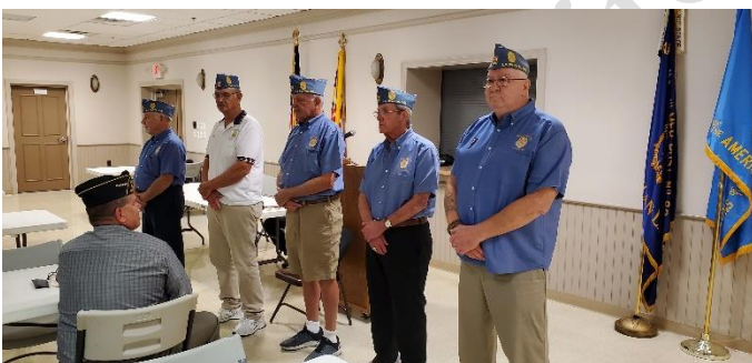
Post 82 Sons officers for the year 2021-2022