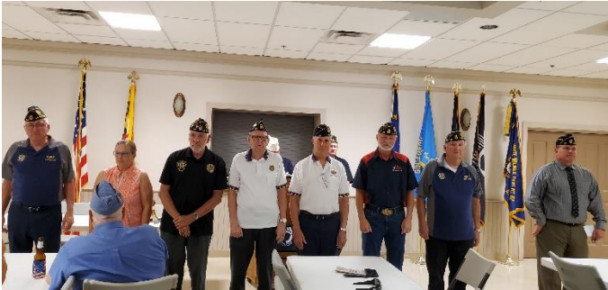
Post 82 Officers for the year 2021-2022

S.A.L. Monthly Meetings are the First Tuesday of Each Month at 6:00 PM